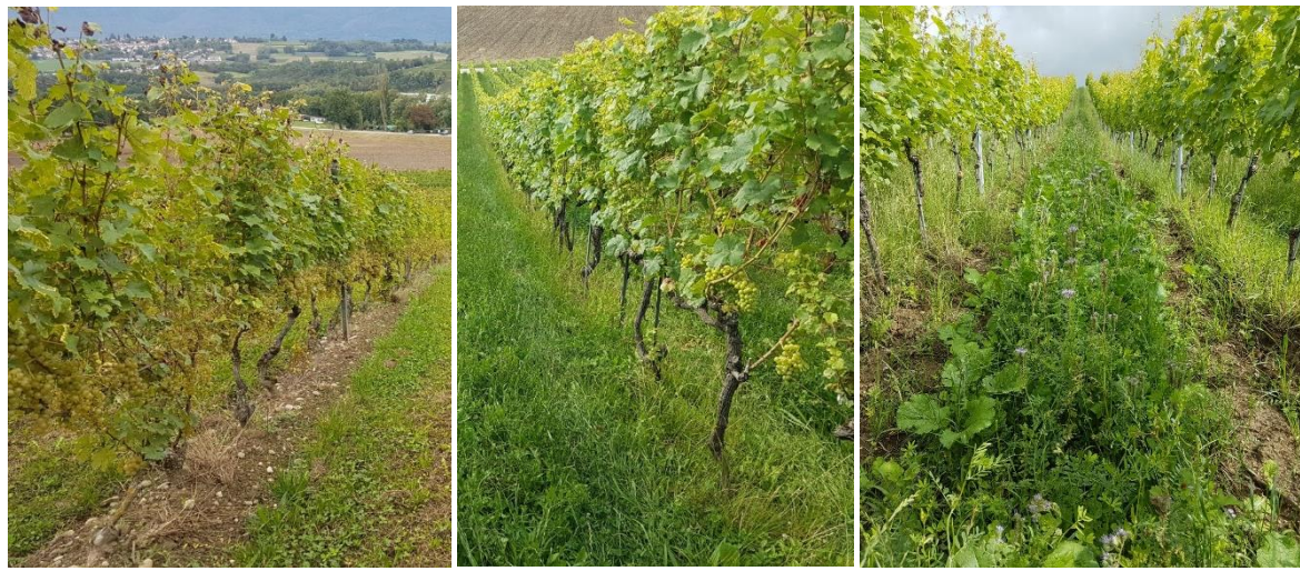
Figure 1. Example of the three different soil management practices in mechanizable vineyards. From left to right: permanent ground cover on the inter-row plus tillage on the under-vine, spontaneous vegetation, winter cover crops.

The project is divided into three phases: 1) diagnosis, 2) on-farm and 3) on-station experiment. For the diagnosis phase, we selected 30 plots in 5 Swiss cantons (Geneva, Vaud, Neuchatel, Valais, Basel), characterized by different pedoclimatic conditions. Fifteen plots were located on mechanizable vineyards and fifteen on terraced vineyards. All plots were planted with Chasselas, the most abundant white variety in Switzerland, which is sensitive to water and nitrogen stress. Three soil management practices have been studied: 1) permanent ground cover on the inter-row plus tillage on the under-vine (i1: mechanized, i5: terraced); 2) spontaneous vegetation (i2: mechanized, i4: terraced); 3) winter cover crops (i3: mechanized, i6: terraced). The treatments (figure 1) were already in place before the beginning of the surveys.